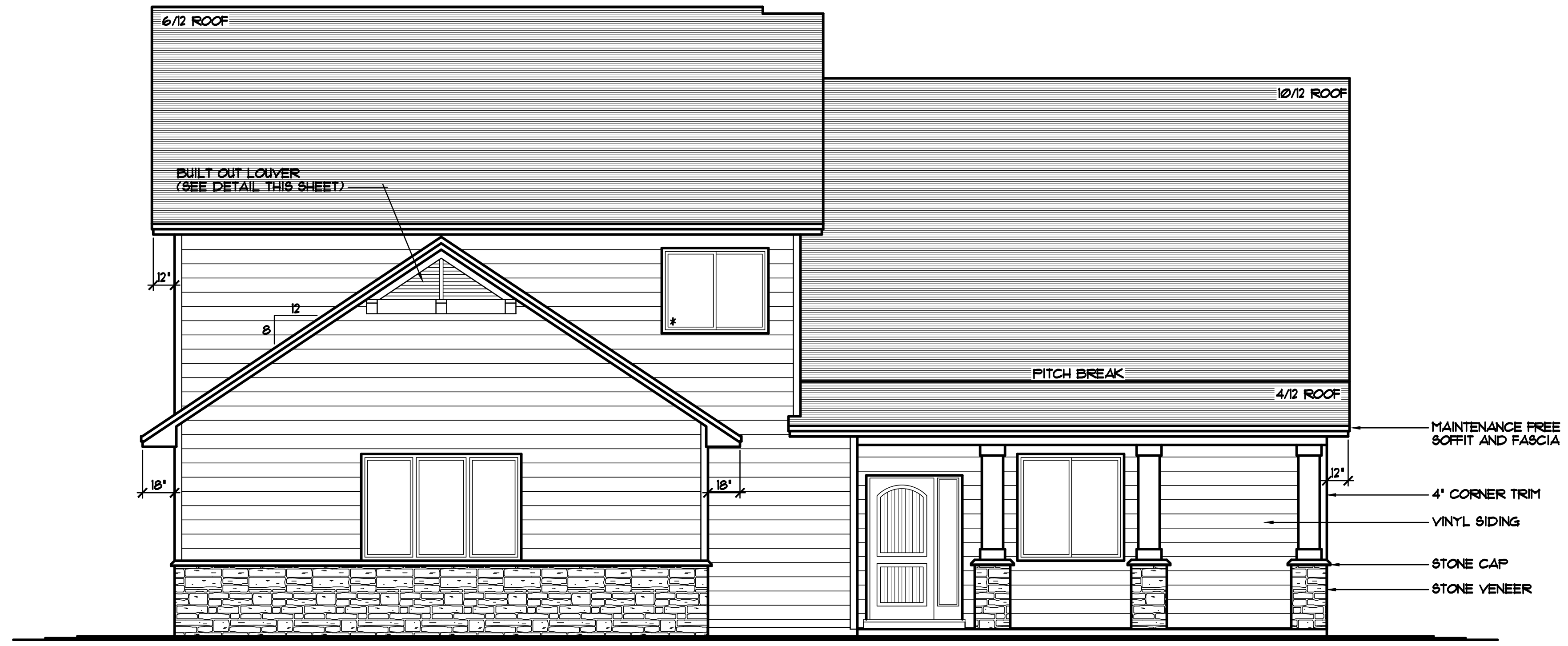
FRONT ELEVATION 1/4"=1'-0" 1816 SQFT. MAIN LEVEL 1010 SQFT. UPPER LEVEL 2886 SQFT. ABOVE GRADE